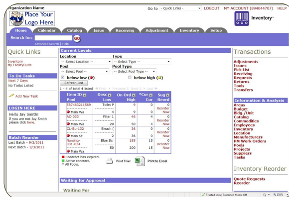
InventoryEdge quickly displays current inventory levels for simple reordering, including items below high and low reorder points.