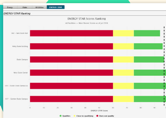
An example of an ENERGY STAR report in Energy Manager